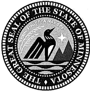
Tim Walz, GOVERNOR